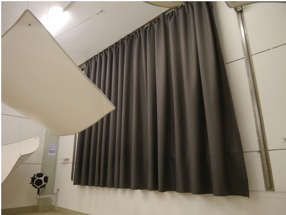
Figure B.2. Test object mounted in the reverberation room, diagonal view.