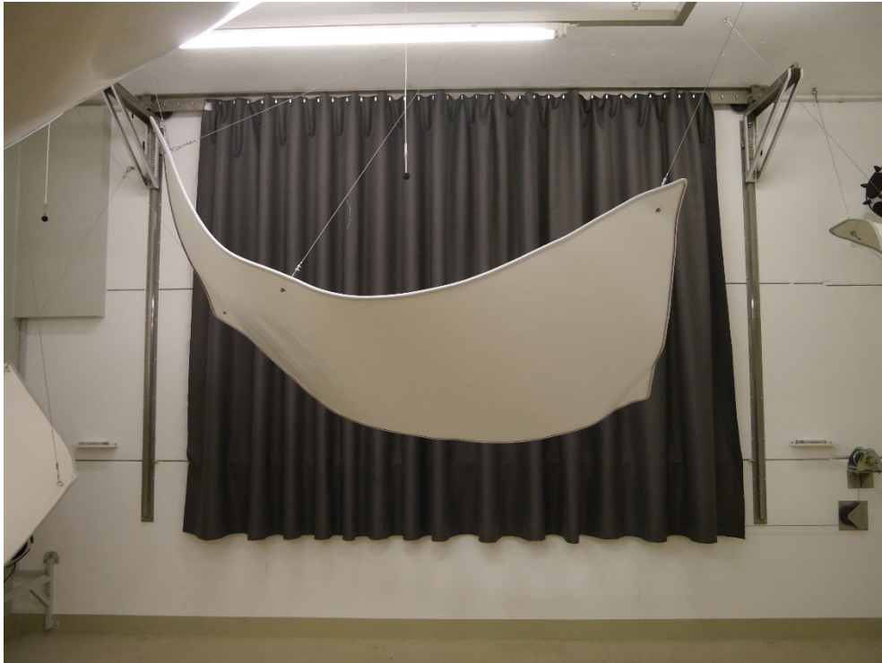
Figure B.1. Test object mounted in the reverberation room, frontal view.